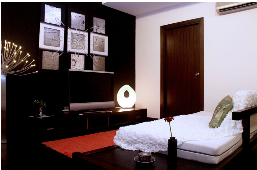
An Art Deco ornament, consisting of nine steel plates with a neo-sunburst motif at its centre, is the focal point of this bedroom.

I hope you enjoy these nuggets and find the ideas inspirational! If you have tips of your own or just want to express your thoughts on Art Deco, do share with us below.