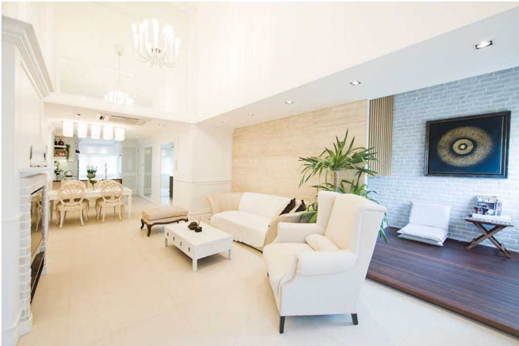
An adaption of the suburst motif hangs on the wall, injecting some Art Deco charm into the lounge area. Check out more pictures from this interior designer.