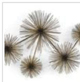
Mid Century Modern Wall Art