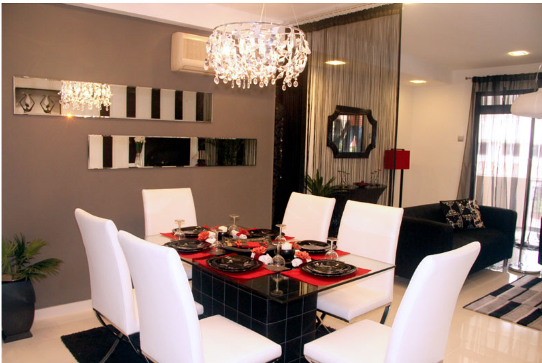
The use of glass, steel and symmetry in this dining room is a clear expression of Art Deco. Check out more pictures from this interior designer.