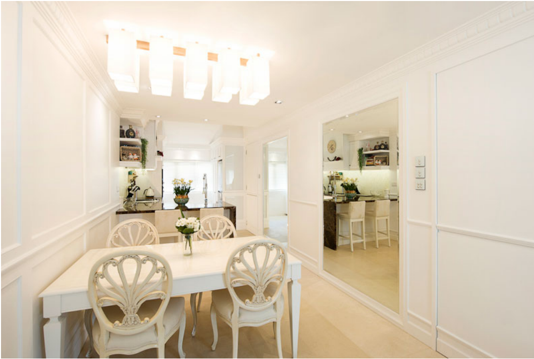
The use of mirrors not only brightens up the space, it also creates an illusion of symmetry that is otherwise hard to achieve in a narrow area.

The phrase "Art Deco" was only coined in 1966 but its roots began in early 19th century France. Even though it has been a hundred years since Art Deco's inception, the linear lines and attention to symmetry, characteristic of Art Deco, still has widespread influences in today's interior design landscape. Here are some ways to incorporate Art Deco into your home!