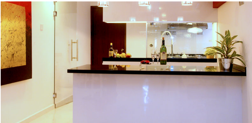
Three symmetrical glass ornamental lamps hang above the bar top. Simple and sweet.