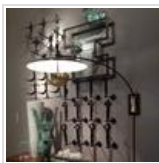
Global Views Tour at the Las Vegas Market 2012