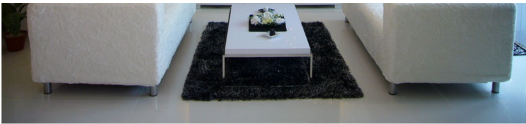
An eclectic living room. Two sofas are placed opposite each other with a coffee table at the centre — classic Art Deco interior design.