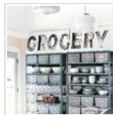
2012 Home Decor Trends: Metallic Tones